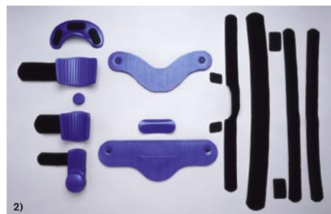
2) 28A12 – Replacement Set