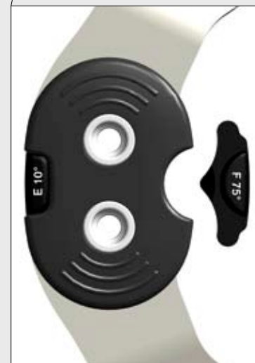
Click-2-Go For easy and tool free adjustment