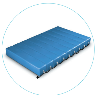
SAT™ system design